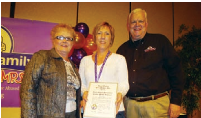
Congratulations to our 15-Year Camp: Crown Point, IN — First United Methodist Church