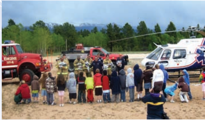
Firetrucks, a helicopter and new shoes! The children from this Colorado Camp were amazed and delighted by an afternoon of wonders — in a beautiful setting near Pike's Peak.

Next, the kids started to hear the rotors of an approaching helicopter.