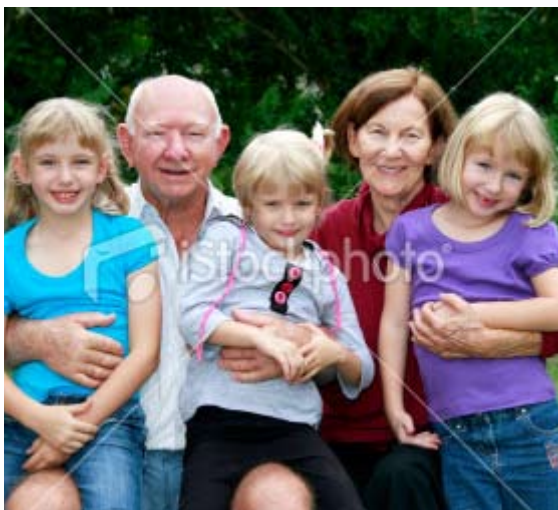
Proper estate planning can benefit you and help the children we serve.

You can support Royal Family Kids' Camps and provide for your own family, too — through proper estate planning and planned giving.