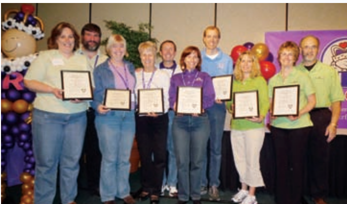
Celebrating our 5-Year Camps: Canton, OH — Faith Family Church Cuyahoga Falls, OH — Northampton United Methodist Geneva, IL — First Baptist Church of Geneva Madison, AL — Asbury United Methodist Church Omaha, NE — Brookside Church Pottsville, AR — Pottsville Assembly of God Church St. Peter, MN — Jesus Assembly of God Church