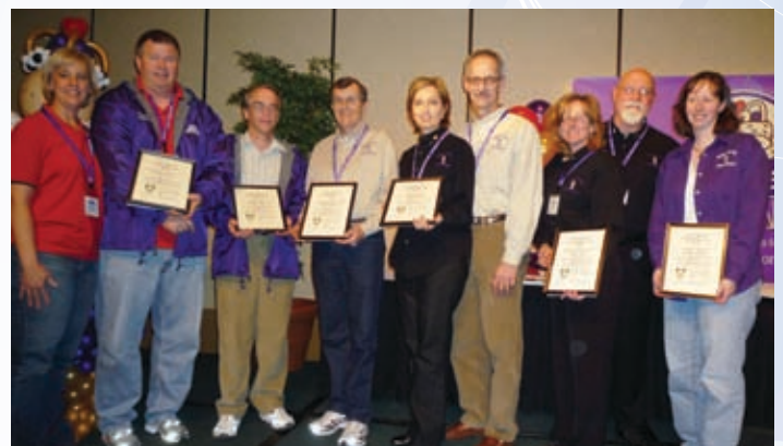
Celebrating our 10-Year Camps: Fort Worth, TX #1 — Richland Hills Church of Christ Cleveland, TN — S. Cleveland Church of God Issaquah, WA — Eastridge Christian Assembly of God Church Tulsa, OK — Christian Chapel Wichita, KS — Westlink Christian Church Midland, MI #2 — Christian Celebration